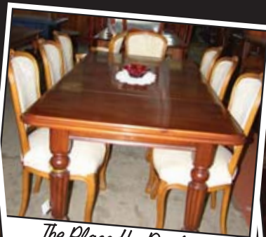
The Place the Dealers Come to Buy