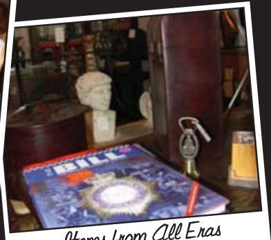
Items from All Eras including Art Deco & Retro

Furniture - Books - Crystal - China - Jewellery - Silver - Tools - Linen - Clothing - Collectables You Name It - We've Got It! - Open 7 days 10am-5pm