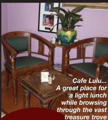
Cafe Lulu... A great place for a light lunch while browsing through the vast treasure trove

The Mornington Antique Centre is open 7 days, 10am to 5pm with plenty of off street parking.