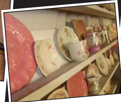
New Items Arriving Daily