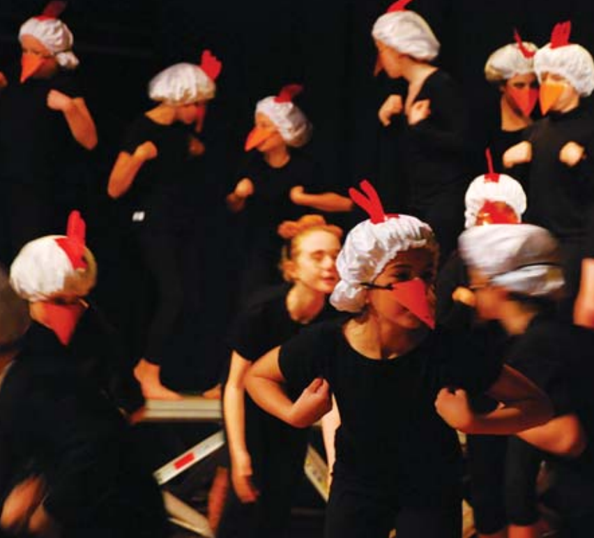
The Foxes were in the Henhouse in Minimbah's recent production of Roald Dahl's 'Fantastic Mr Fox.'