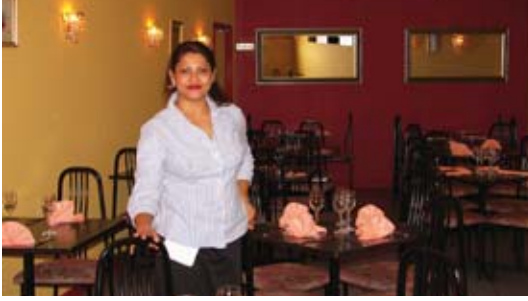
With a fresh coat of paint and new decor an old favourite is now better than ever. MORNINGTON MASALA under went some changes earlier this year and the lighter, brighter colours of the restaurant make an even more appealing place to dine and enjoy good food and the company of friends and family. Located on Albert Street, parking is a breeze. Friendly service, great food makes for the perfect night out.